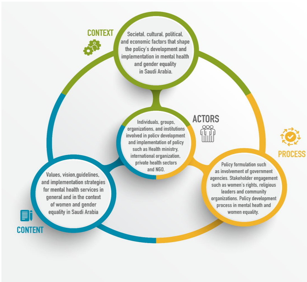
Figure 3 The Walt & Gilson (1994) policy triangle model.