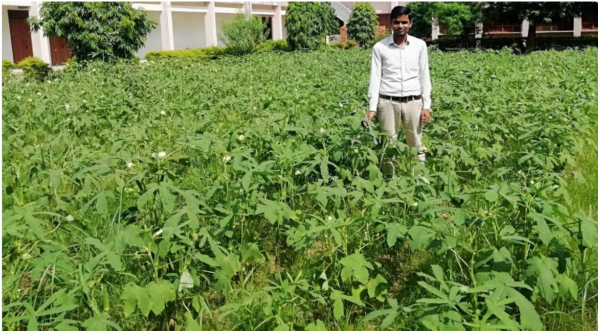
Figure 2: Measurement of Okra by Researcher during the study