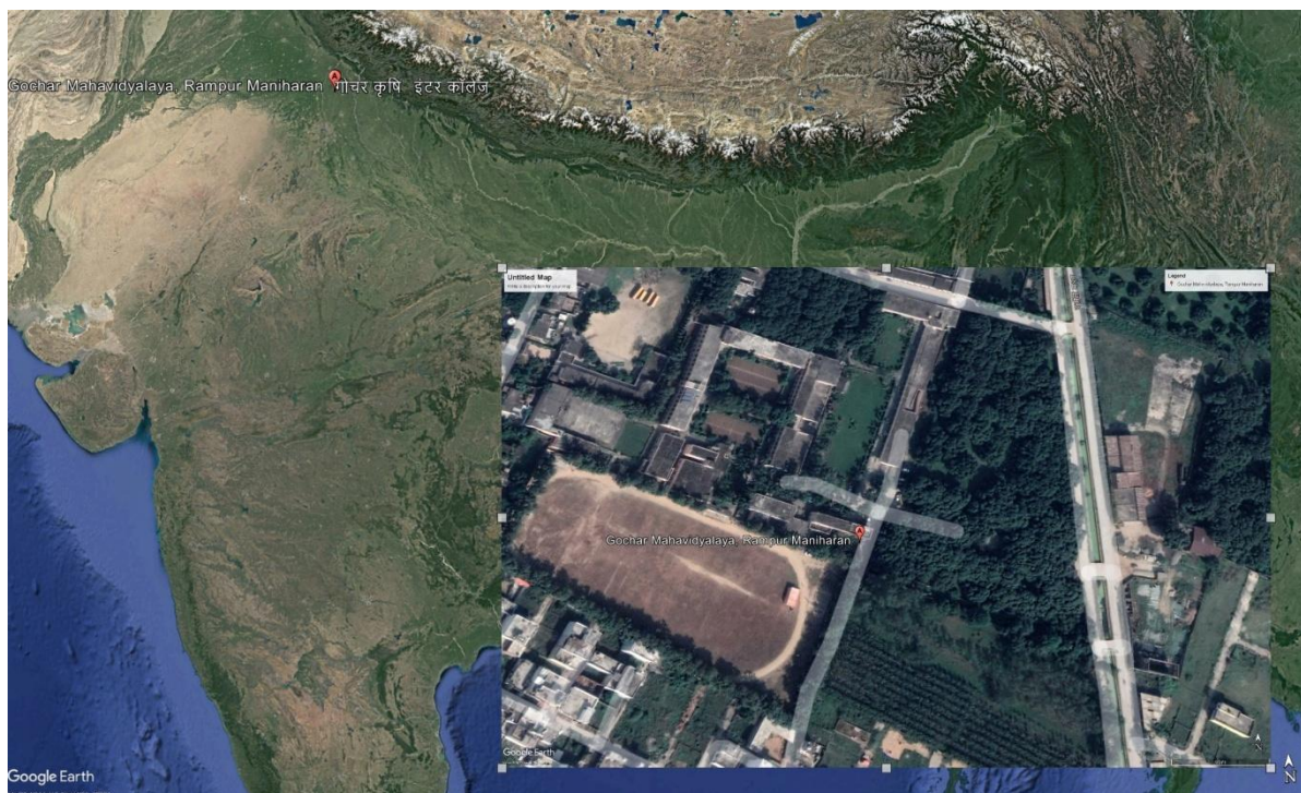
Fig. 1 Example of location on the satellite map of the experimental field. Unfortunately, the very limited information on the location of the experimental field does not allow obtaining a better map (which also allows the visualization of the plots corresponding to the 17 treatments plus the control).