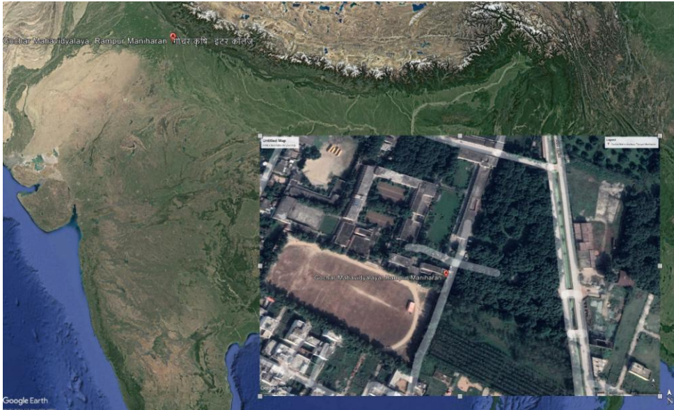
Fig. 1 Example of location on the satellite map of the experimental field. Unfortunately, the very limited information on the location of the experimental field does not allow obtaining a better map (which also allows the visualization of the plots corresponding to the 17 treatments plus the control).