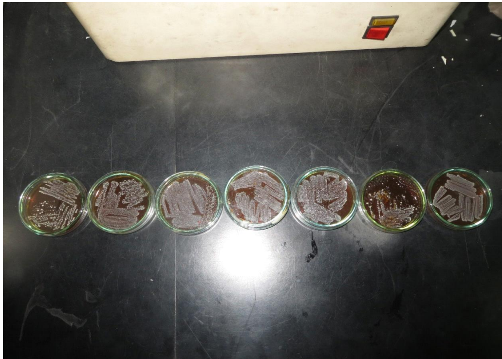
Fig. 2. Growth of Lactobacilli colonies in petri dishes inoculated from stools collected by swabs from poultry in the experimental group (GELB)