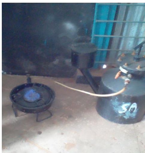
Fig 3: Flammability check using a gas burner