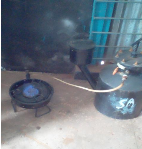
Fig 3: Flammability check using a gas burner