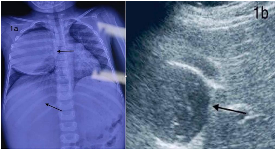
Figure.1a. Chest X-ray revealed a large dense round well demarcated opacity involving the right lung field and opaque homogenous zone of cyst in right upper abdomen (marked by arrows), 1b. Ultrasound abdomen revealed well defined unilocular cystic lesion with internal echoes and no internal septations (marked by arrow)