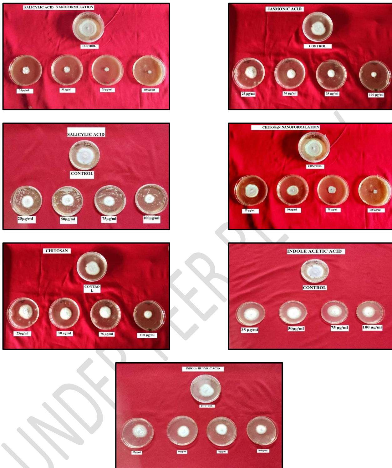
Plate 1: In vitro evaluation of non- conventional chemicals against Fusarium oxysporum