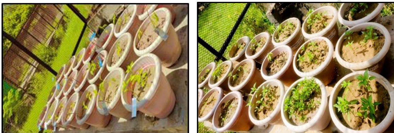
Plate 2: Evaluation of non-conventional chemicals against Fusarium oxysporum under screen house conditions

and soil drenching with Jasmonic acid @ 100 µg/ml. In Pusa Sadabahar, the percent disease severity was maximum (75%) in pots inoculated with Fusarium oxysporum . The minimum disease severity (31.25%) was recorded in pots inoculated with Fusarium oxysporum + seedling dip and soil drenching with Salicylic acid nano formulation @ 100 µg/ml followed by 43.75% disease severity in pots inoculated with Fusarium oxysporum + seedling dip and soil drenching with Jasmonic acid @ 100 µg/ml (Table 4, Fig. 2 and Plate 2). Mandal et al. [20] studied the effect of salicylic acid on tomato wilt and reported that the percent disease incidence was markedly reduced in plants treated with 200 mM salicylic acid (SA) by root dip and foliar spray whereas untreated plants exhibited typical symptoms of vascular browning, leaf yellowing and wilting. Similarly, Nasir et al. [18] evaluated four plants activators and the minimum disease incidence was expressed by salicylic acid (26.68%).