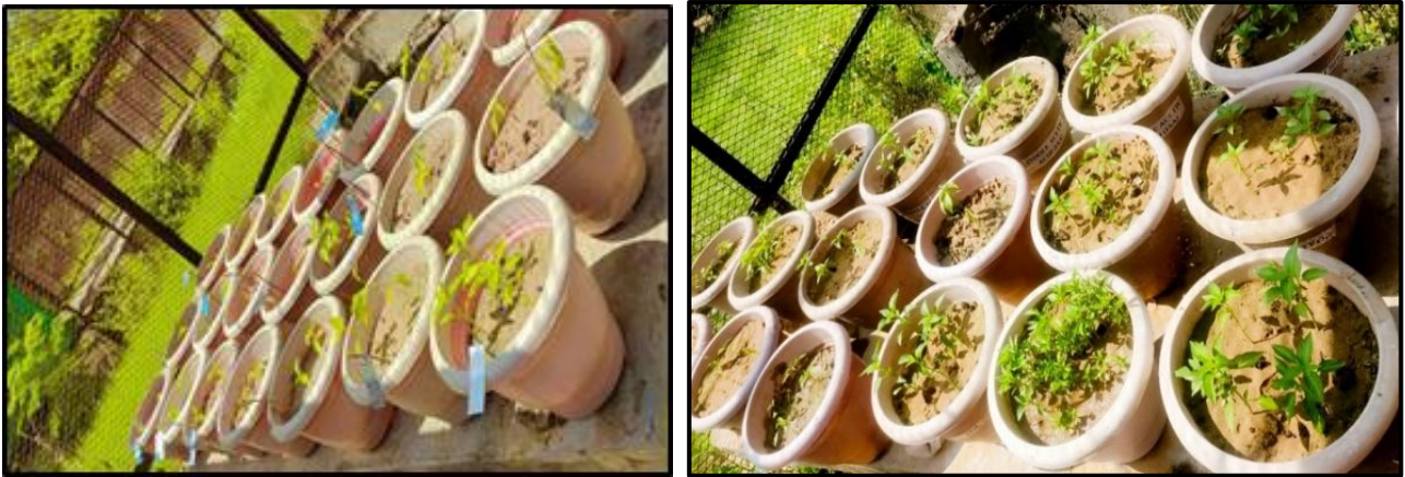
Plate 2: Evaluation of non- conventional chemicals against Fusarium oxysporum under screenhouse conditions

and soil drenching with Jasmonic acid @ 100 µg/ml. In Pusa Sadabahar, the percent disease severity was maximum (75%) in pots inoculated with Fusarium oxysporum . The minimum disease severity (31.25%) was recorded in pots inoculated with Fusarium oxysporum + seedling dip and soil drenching with Salicylic acid nanoformulation @ 100 µg/ml followed by 43.75% disease severity in pots inoculated with Fusarium oxysporum + seedling dip and soil drenching with Jasmonic acid @ 100 µg/ml (Table 4, Fig. 2 and Plate 2). Mandal et al. [20] studied the effect of salicylic acid on tomato wilt and reported that the percent disease incidence was markedly reduced in plants treated with 200 mM salicylic acid (SA) by root dip and foliar spray whereas untreated plants exhibited typical symptoms of vascular browning, leaf yellowing and wilting. Similarly, Nasir et al. [18] evaluated four plants activators and the minimum disease incidence was expressed by salicylic acid (26.68%).