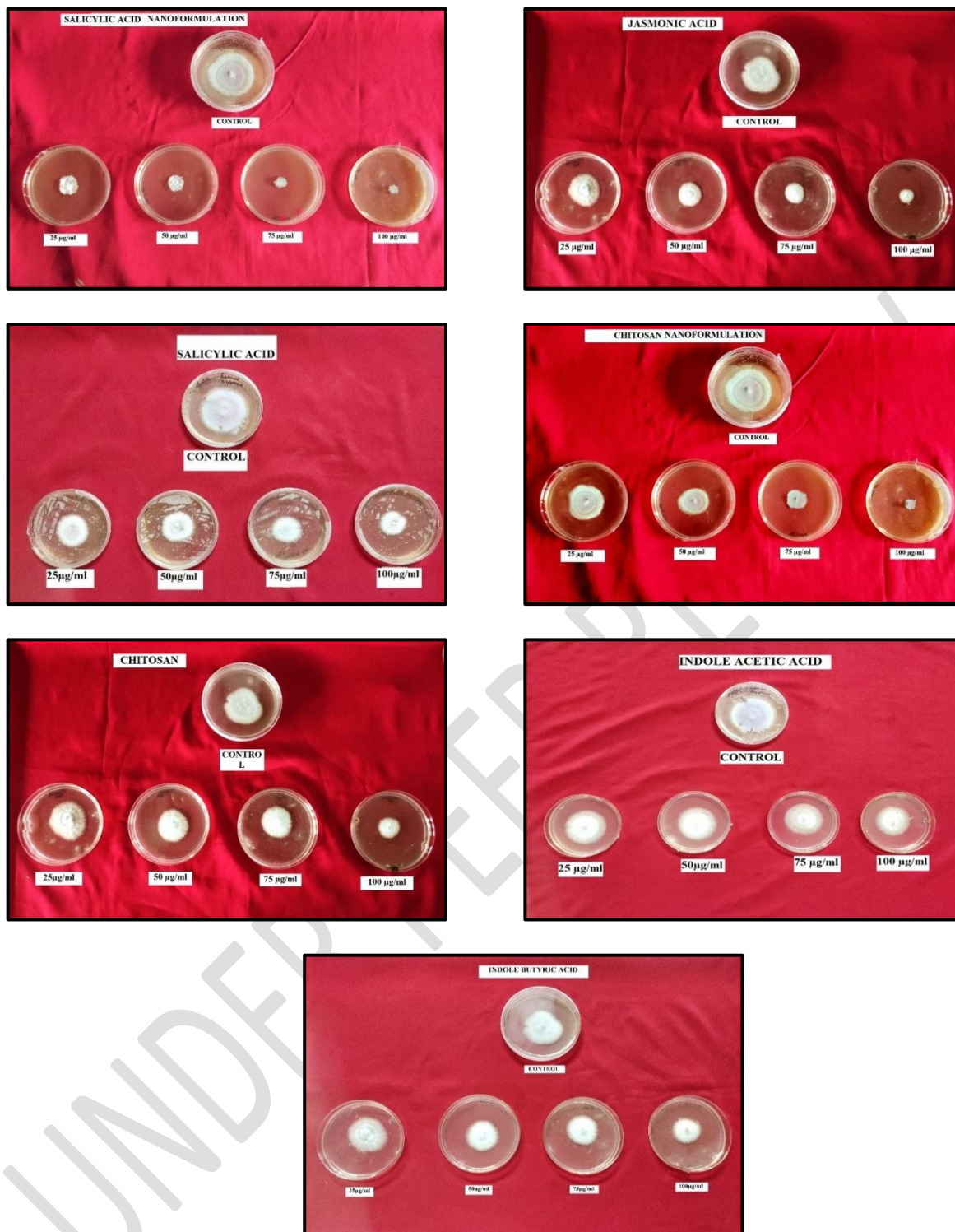
Plate 1: In vitro evaluation of non- conventional chemicals against Fusarium oxysporum