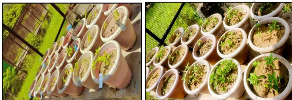
Plate 2: Evaluation of non- conventional chemicals against Fusarium oxysporum under screenhouse conditions

and soil drenching with Jasmonic acid @ 100 µg/ml. In PusaSadabahar, the percent disease severity was maximum (75%) in pots inoculated with Fusarium oxysporum . The minimum disease severity (31.25%) was recorded in pots inoculated with Fusarium oxysporum + seedling dip and soil drenching with Salicylic acid nanoformulation @ 100 µg/ml followed by 43.75% per cent disease severity in pots inoculated with Fusarium oxysporum + seedling dip and soil drenching with Jasmonic acid @ 100 µg/ml (Table 4, Fig. 2 and Plate 2). Mandal et al. [17] studied the effect of salicylic acid on tomato wilt and reported that the percent of disease incidence was markedly reduced in plants treated with 200 mM salicylic acid (SA) by root dip and foliar spray whereas untreated plants exhibited typical symptoms of vascular browning, leaf yellowing and wilting. Similarly, Nasir et al. [15] evaluated four plants activators and among four plant activators, the minimum disease incidence was expressed by salicylic acid (26.68%).