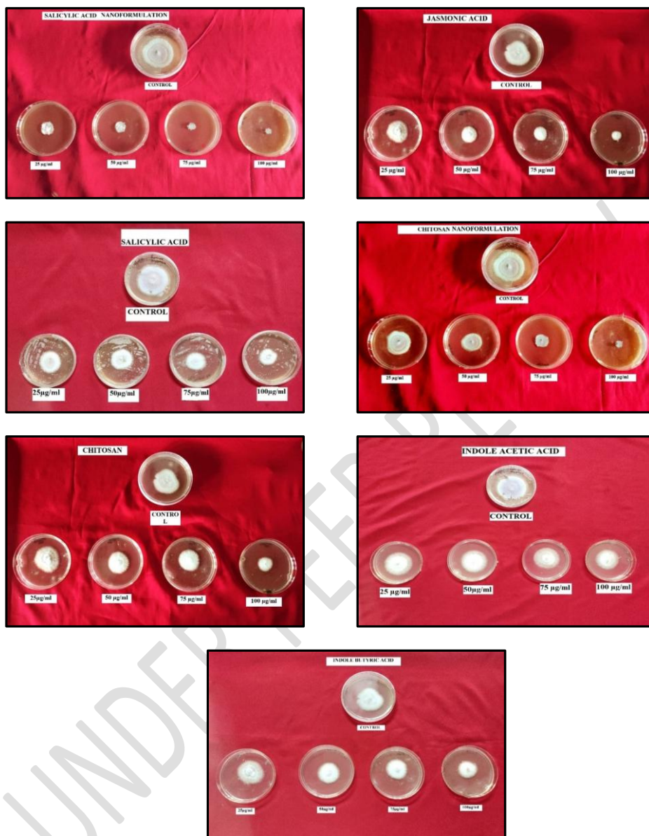
Plate 1: In vitro evaluation of non- conventional chemicals against Fusarium oxysporum