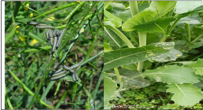
Fig 2- Some insect pests of rape seed mustard In Kashmir Valley.1,Shield bug,2 Lipaphis erysimi 3, Pieris brassicae 4, Phytomyza horticola