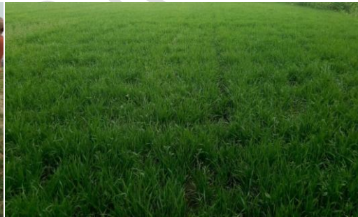
Figure 2 Field day on Zero-till sowing of wheat