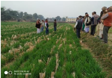
Figure 1 Broadcast sowing of wheat

The majority of farmers do not fully embrace agricultural technology in all areas. As a result, there consistently seems to be a discrepancy between the technology that scientists advocate and its modified version at the level of the farmer. Thus, the main obstacle to raising agricultural productivity in the nation is the technology divide. It is necessary to reduce the technological gap between agricultural technology developed by scientists and its application by farmers on their farms. The current inquiry attempted to look at the production gaps between farmers' yield and that of the Front Line Demonstration trial, the level of technological adoption, and the benefit-cost ratio.