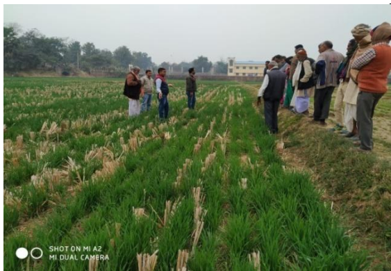
Figure 1 Broadcast sowing of wheat

The majority of farmers do not fully embrace agricultural technology in all areas. As a result, there consistently seems to be a discrepancy between the technology that scientists advocate and its modified version at the level of the farmer. Thus, the main obstacle to raising agricultural productivity in the nation is the technology divide. It is necessary to reduce the technological gap between agricultural technology developed by scientists and its application by farmers on their farms. The current inquiry attempted to look at the production gaps between farmers' yield and that of the Front Line Demonstration trial, the level of technological adoption, and the benefit-cost ratio.