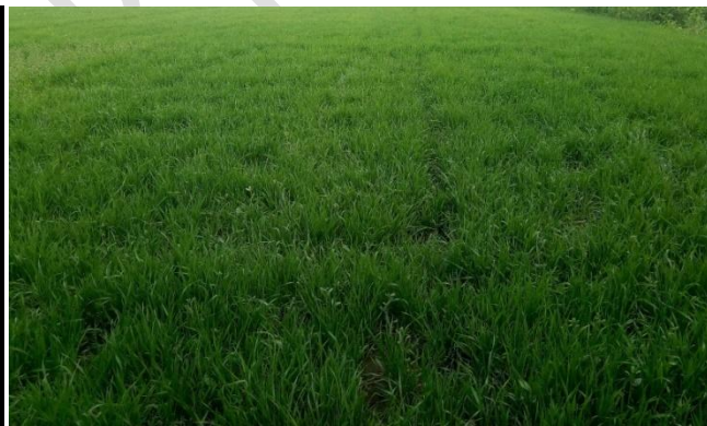
Figure 2 field day on Zero-till sowing of wheat