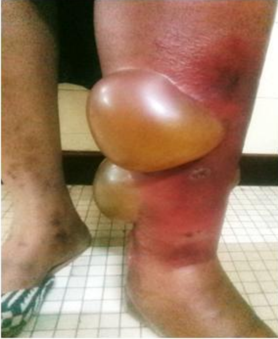
Figure 4: necrotizing dermohypodermatitis of the leg