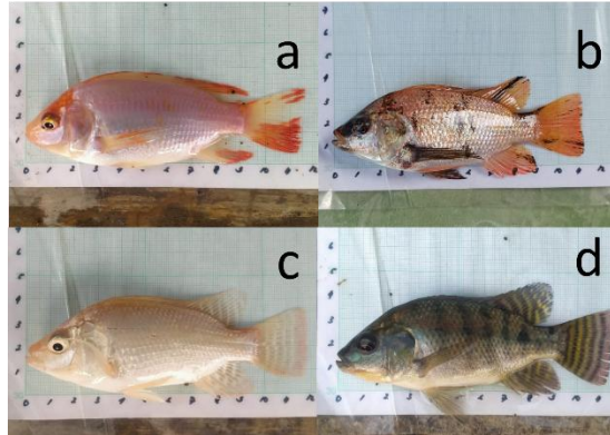
Figure 3. Observed Tilapia

Description : A) White Tilapia (♂) x Black Tilapia (♀), B) Black Tilapia (♂) x White Tilapia (♀), C) White Tilapia (♂) x White Tilapia (♀), D) Black Tilapia (♂) x Black Tilapia (♀).