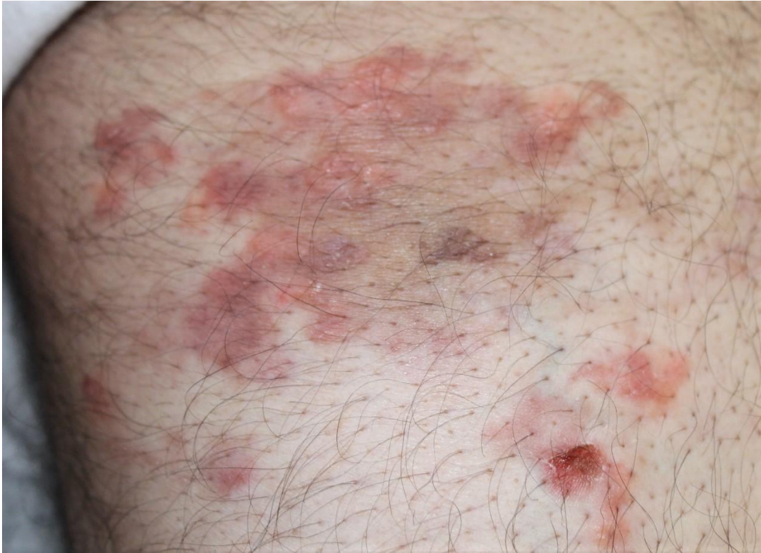
Fig.1 (a). Erythematous plaques with papules, vesicles, and bullae on the leg.

(b). Improvement of the lesion with postinflammatory hyperpigmentation after dapsone treatment.