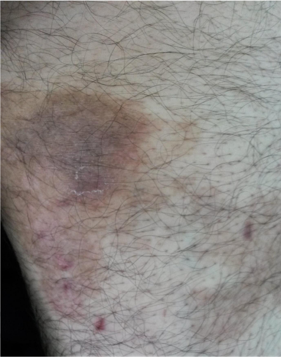
Fig.1 (a). Erythematous plaques with papules, vesicles, and bullae on the leg.

(b). Improvement of the lesion with postinflammatory hyperpigmentation after dapsone treatment.