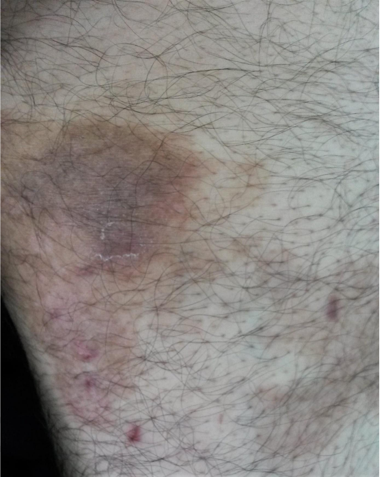
Fig.1 (a). Erythematous plaques with papules, vesicles, and bullae on the leg.

(b). Improvement of the lesion with postinflammatory hyperpigmentation after dapsone treatment.