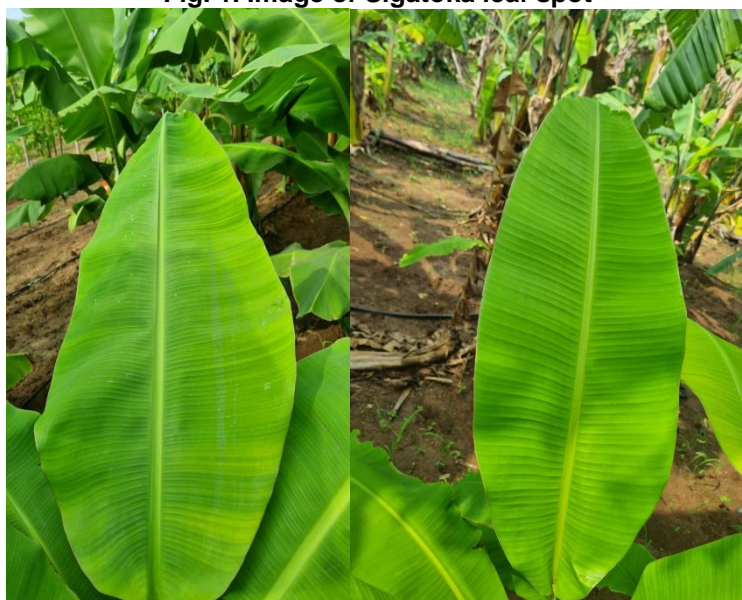
Fig. 2. Healthy leaves of banana

During the experiment raw data is identified and instructive labels are added. The categorization label is the one that has the highest chance of being utilized (completely linked layer). After completing the first training phase, load the training images, configure the learning rate, run the optimizer and creates the training convolution model.