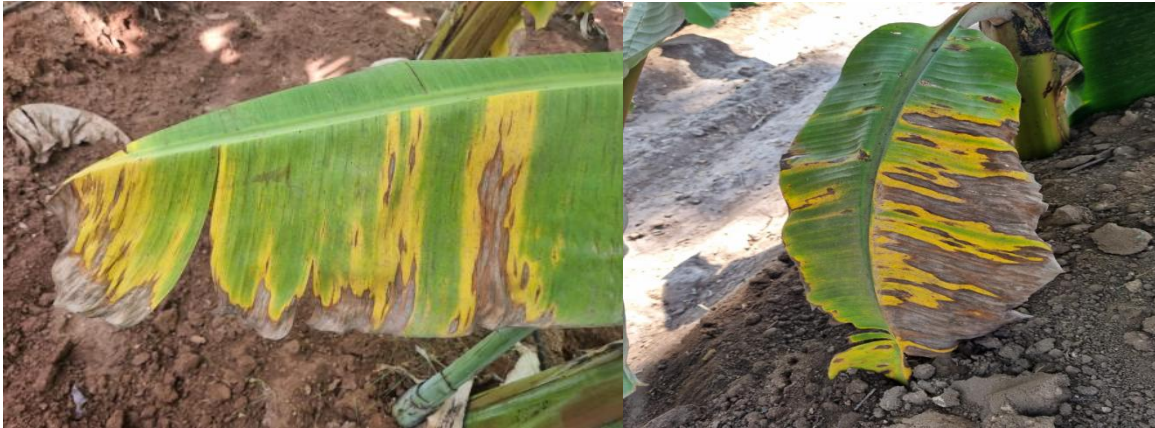
Fig. 1. Image of Sigatoka leaf spot