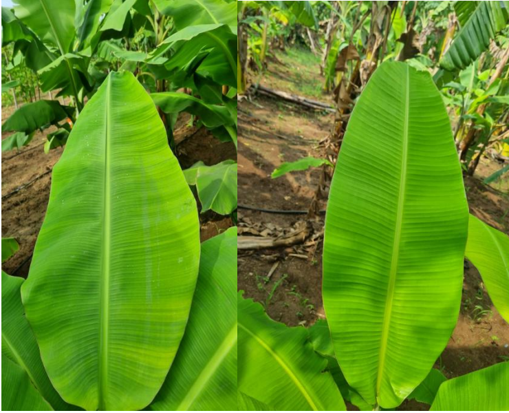
Fig 2:Healthy leaves of Banana