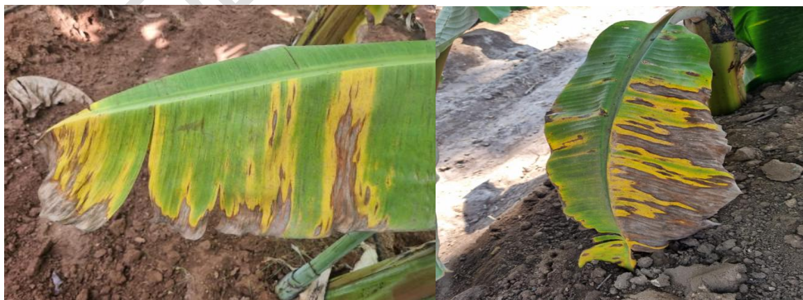
Fig 1:Image of Sigatoka leaf spot

In Sigatoka disease symptoms include pale yellow streaks (1 to 2 mm) that eventually combine to create dark, rusty brown to black patches encircled by a yellow halo are the first signs of the condition. The spots combine to produce enormous, erratic swaths of desiccated tissue. This disease's defining characteristics include rapid drying, leaf defoliation, smaller bunch sizes, and irregular ripening of fruit. We collected pictures of healthy banana plants which showed no symptoms of any disease.