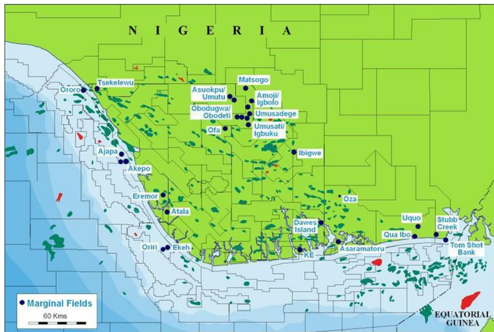
Figure 1: Marginal Fields for the 2003 Bidding Round (MBing, 2017).

of the Federal Government announced that a total of 57 fields will be offered on land, swamp, and shallow offshore terrains. The exercise would be conducted electronically and would include expression of interest/registration; prequalification, technical and commercial bid submission, and bid evaluation. The first bid round that was formally organized by the FGN began in 2001 and was concluded in 2003. The fields covered are as shown in Figure 1. At the end of the bid round, 24 licences were awarded to 31 indigenous companies. Another bid round was proposed in 2013 with a lot of preparation and published guidelines. Unfortunately, it never held (Tokunbo, 2014: DPR., 2020).