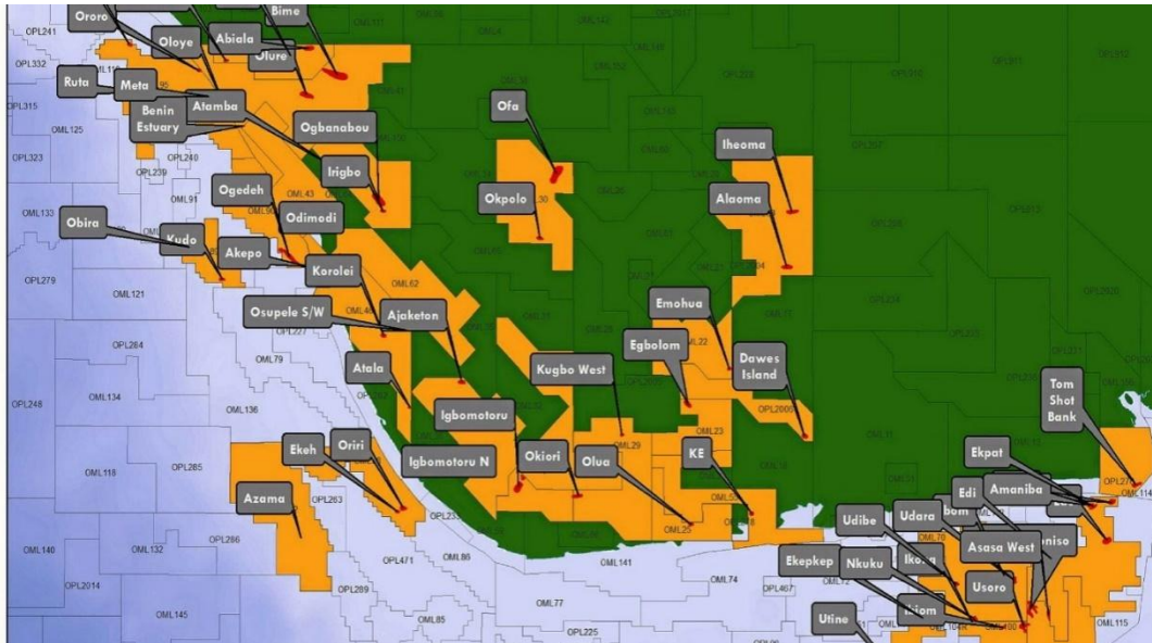
Figure 2: Marginal Fields for the 2020 Biding Round (Esau and Morgan, 2020).