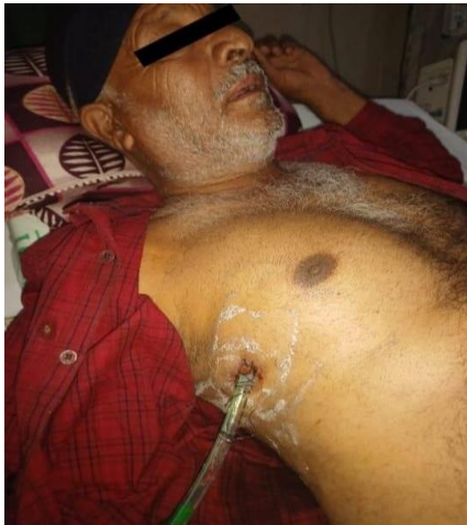
FIGURE 1: Intercostal Tube Drain in Case Of Pneumohemothorax Secondary to Blunt Trauma Chest

edge of the rib to avoid the neurovascular bundle that lies beneath the rib. The retaining stitch will be secured and care is taken not to obliterate the drain. The drain will be connected to an underwater seal device which functions as a one-way valve.