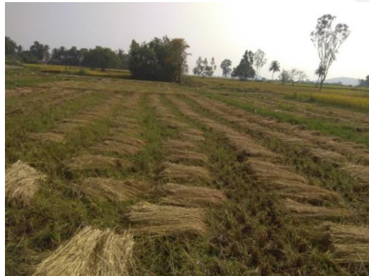
Paddy Land Use System