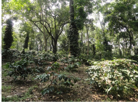
Coffee Based Agroforestry