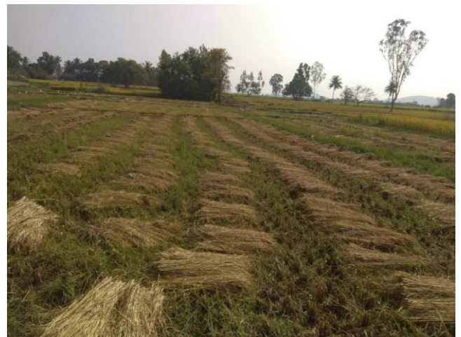
Paddy Land Use System