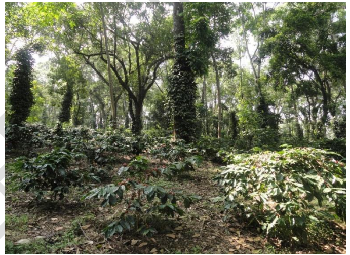
Coffee Based Agroforestry