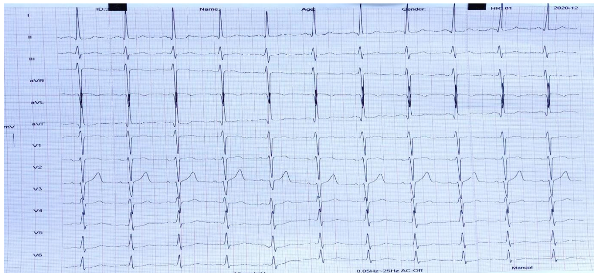
Figure 1 : EKG tracing displayed sinus rhythm, a slow progression of R wave in anterior leads along with 0.5 mm ST segment depression in apical and lateral leads

Physical examination did not reveal wheezing, jugular venous distension, or pedal edema. The electrocardiogram (EKG) tracing displayed sinus rhythm, a gradual progression of R wave in anterior leads, and no significant ST segment depression (Figure 1).