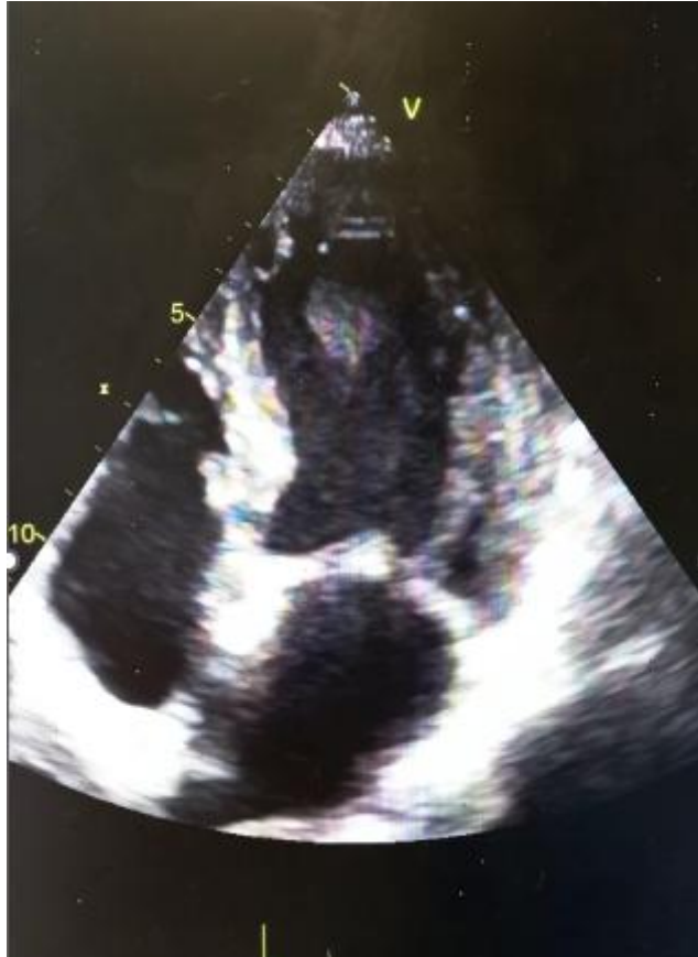
Figure 2 : Transthoracic echocardiography showing a reduced left ventricular ejection fraction of 42% with impairment of regional systolic contractility interesting apical and anterior segments associated with an intense intracavitary contrast

Laboratory tests revealed a notably elevated brain natriuretic peptide (BNP) level of 1697 pg/ml (normal range: 0–100 pg/ml) and an initial troponin level of 0.05 ng/ml (normal range: < 0.04 ng/ml).