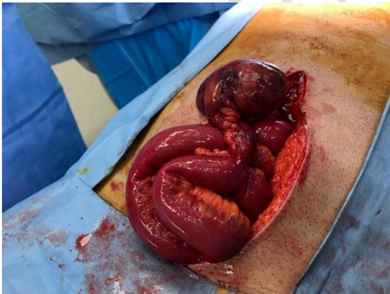
Image 2: Intraoperative finding of a strangulated Meckels diverticulum secondary to axial torsion on its base with purulent peritonitis