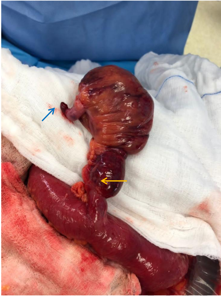
Image 3: Meckel's diverticulum with mesodiverticular band (blue arrow) and narrow base (yellow arrow)