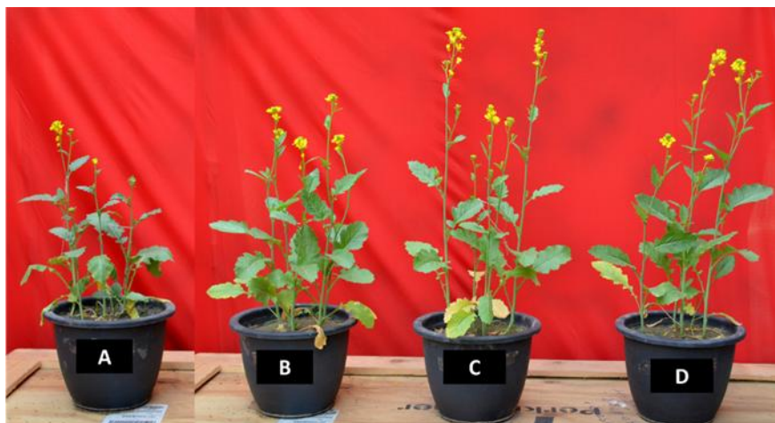
Figure 1. Pot experiment (A. control pot; B, C and D are the treated pots by dimethyl sulfoxide-intercalated bentonite, Fe-exchanged bentonite and Fe-exchanged red mud respectively at the rate of 5.00 \text{ g kg}^{-1} )