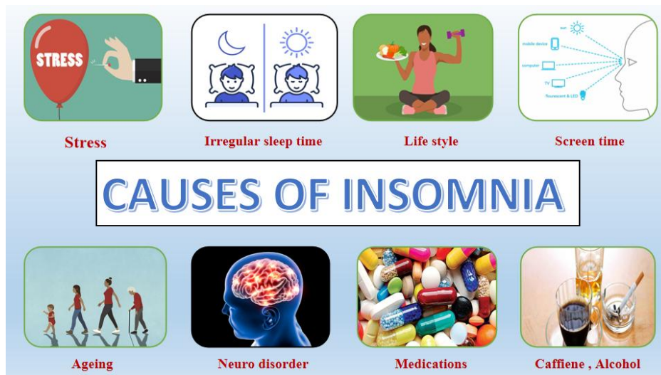
Figure 1 : Causes of insomnia

Health conditions : Chronic pain, cancer, diabetes, heart illness, asthma, gastroesophageal reflux disease (GERD), an overactive thyroid, Parkinson's disease, and Alzheimer's disease are a few disorders that have been linked to sleeplessness.