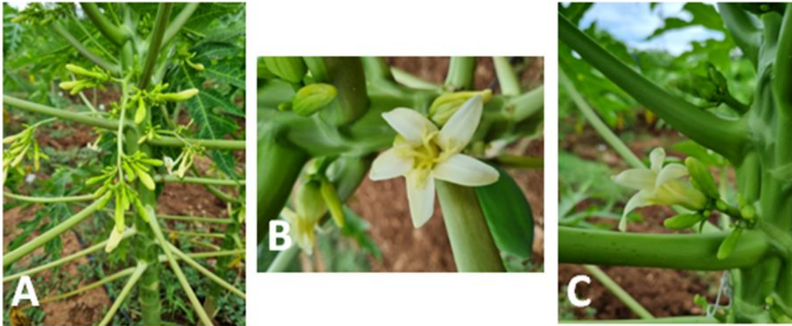
Fig. 1. The Flowers of papaya. (A) Male flowers; (B) Female flowers; (C) Hermaphrodite flowers

Hermaphrodite and female plants have short inflorescences with few flowers, in contrast to panicles of male plants which contain dozens of flowers and are very long and pendulous (Decraene and Smets 1999; Ming et al. , 2007). Female plants are more valued commercially compared to male papaya plants due to their fruit production. Female plants, however, contain less flesh and produce large number of seed compared to hermaphrodite plants.