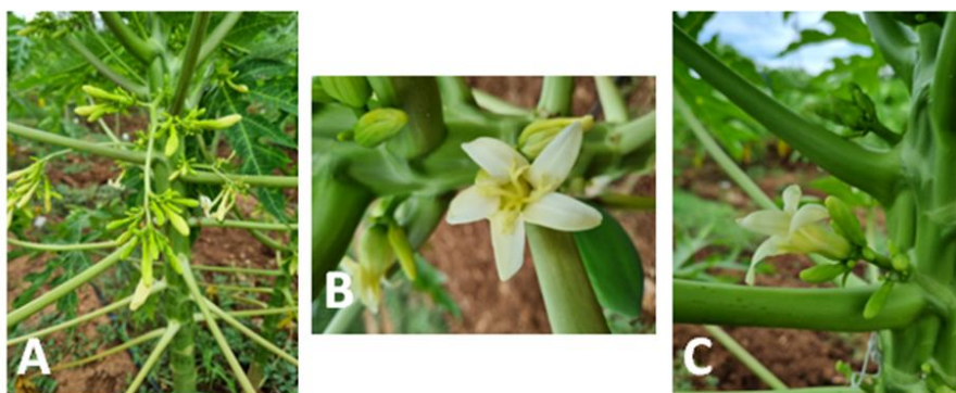
Fig. 1. The Flowers of papaya. (A) Male flowers; (B) Female flowers; (C) Hermaphrodite flowers

Hermaphrodite and female plants have short inflorescences with few flowers, in contrast to panicles of male plants which contain dozens of flowers and are very long and pendulous (Decraene and Smets 1999; Ming et al. , 2007). Female plants are more valued commercially compared to male papaya plants due to their fruit production. Female plants, however, contain less flesh and produce large number of seed compared to hermaphrodite plants.