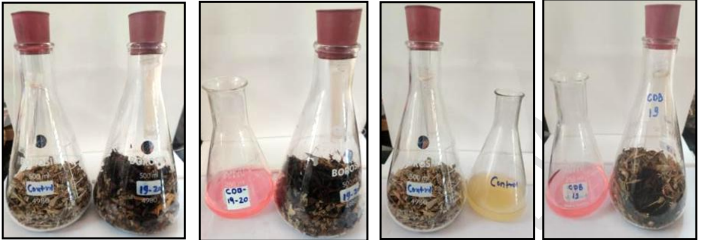
Plate 1. Results of CO 2 evolution test