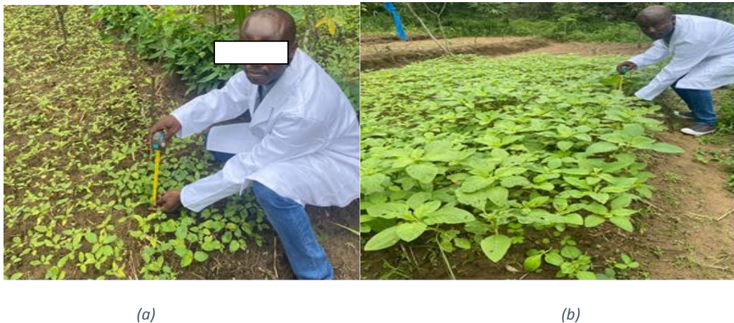
Fig. 6 : (a) Measurement of Amaranth stems in control soil and (b) composted soil after 21 days of growth.