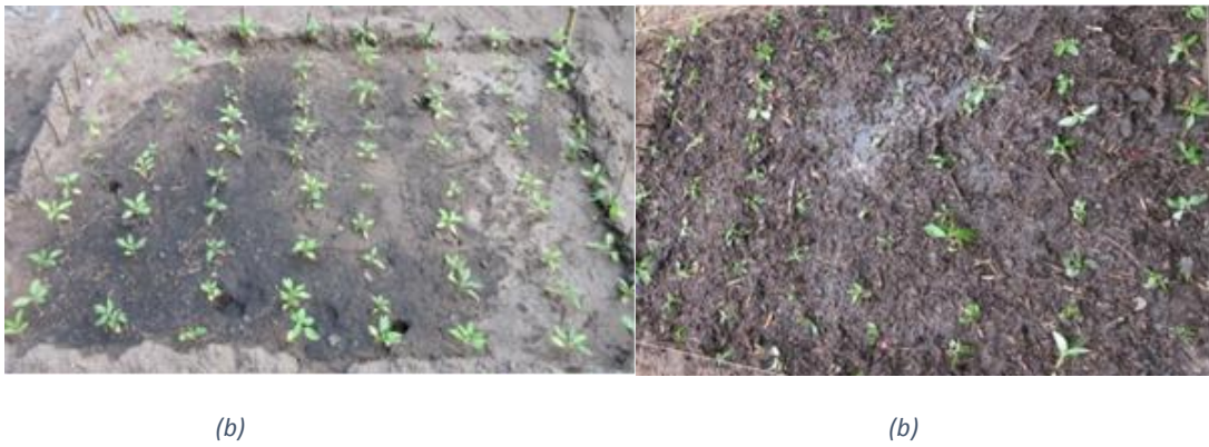
Fig. 4 : (a) Amaranths on the first day in control soil and (b) compost-amended soil

The different heights of amaranth stems in control and composted soils after 21 days of growth are shown in Figures 4 (a & b) 5 (a & b) and 6 (a & b) below.