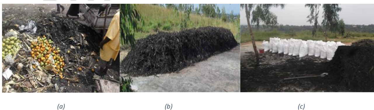
Fig. 2: (a) Pile of biodegradable waste, (b) compost wall and (c) packaging compost in bags

The mature compost packaged in bags after 3 months is presented in figure 2 (a, b and c) below: