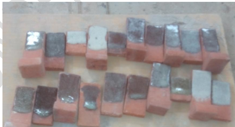
Plate 4: Test Blend Result of Files glaze number 11-26

The glaze sample are 11, 12, 13, 14, 15, 16, 17, 18, 19, 20, 21, 22, 23, 24, 25 and 26. Only sample, 11, 12, 14, 15, 17, 22, 23, 25, and 26 melt very well at 1050°C to 1080°C, while glaze sample 13, 16, 18, 19, 20, 21 and 24 did not melt on the test tiles. Sample, 23, 25 and 26 are transparent after firing to 1080°C. Glaze sample 12, 14, 15 and 17 are matte after firing to 1080°C. Sample 11 and 22 are opaque after firing to 1080°C. Glaze sample 11, 12, 23, 25, and 26 craze on the test tile body. Glaze sample 12, 14, 15 and 17 did not craze on the test tile. Sample 22 and 26 run on the test tile.