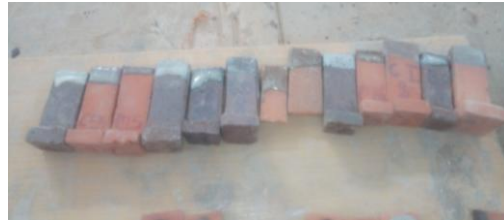
Plate 3: Test Blend Result of Files glaze number 1 -10

The glaze sample are 1,2,3,4,5,6,7,8,9,10. Only glaze sample 1,4,5,6,7,8 melted completely at 1140°C and have cracks. Glaze sample 1,7 and 8 was matt after firing to 1120°C. Sample 1, 4, 7, and 8 was fired to higher temperature of 1130°C, the glaze sample fired melted well but glaze sample 7 was transparent while sample 4 was translucent. Glaze sample 5 and 6 are clear transparent and melted well at 1100°C but have cracks. Glaze sample 2,3,10 did not melt. Glaze sample 9 melted well under reduction firing.