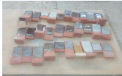
Plate 5: Test Result after Adjusting Crazing

After firing all this glaze sample the crazing only reduce and not eliminated, because of this more test ware carried out on the glaze body while keeping the glaze constant,