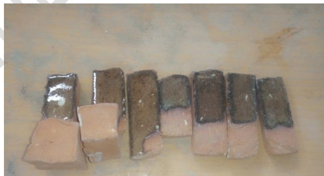
Plate 6: Test Result after Adjusting Runny

Glaze sample 26, the borax was vary by 5% decrease making, the borax, 37.6%, 32.6%, 27.6%, 22.6% and 17.6% borax while the kaolin was constant at 15% , control crazing and runny.