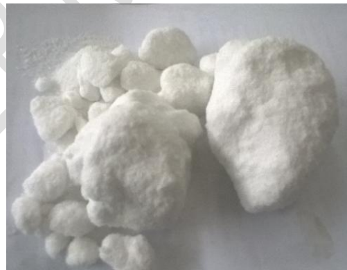
Plate 2: Borax Frit in Dekina in Kogi State