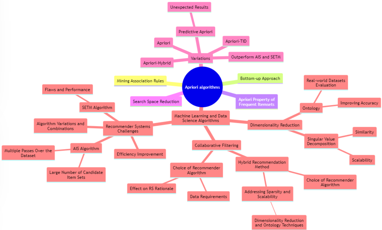
Fig 2. Various way to solve different problems of algorithm.

The literature on machine learning and data science has proposed many algorithms for reducing data dimensions [1]. Singular Value Decomposition (SVD) is used for dimensionality reduction to find similar items and users [4]. Additionally, ontology is used to improve the accuracy of recommendations in the CF part [4]. This method is effective in improving the sparsity and scalability issues associated with CF and has been evaluated on real-world datasets to show its effectiveness [4]. Collaborative Filtering (CF) approaches are used to develop a new hybrid recommendation method [4]. Moreover, Dimensionality reduction and ontology techniques are used to address the drawbacks of sparsity and scalability [4]. The choice of recommender algorithm is critical in terms of accuracy and computation time [4].