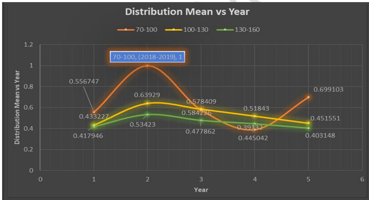
Fig 3. Graphical distribution of Distribution Mean vs Year.