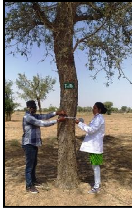
Fig 5: Girth wise data collection