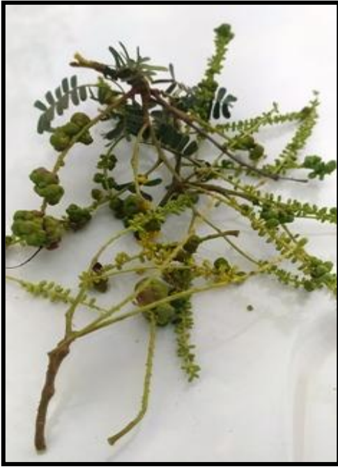
Fig 4: Khejri flower gall