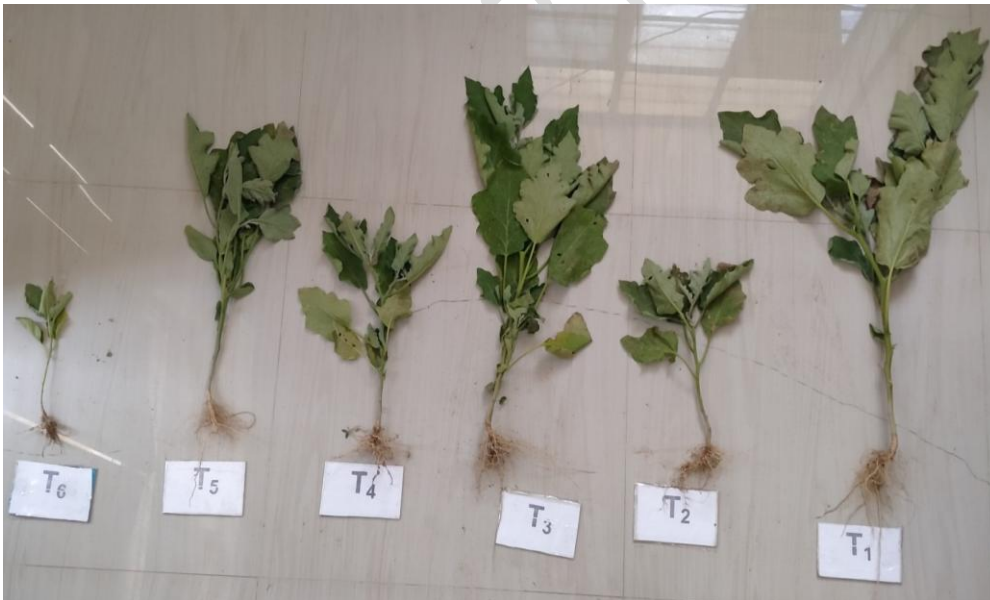
Plate 2 Management of root-knot nematode, Meloidogyne javanica on brinjal through bio-agents.