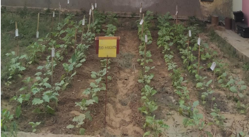
Plate-1: Over view of bio-agent treated field of brinjal