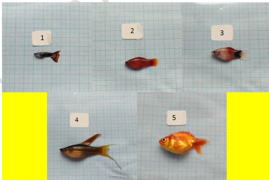
Figure 1. Poeciliidae Fish

Genomic DNA isolation applies procedures and methods according to the Genomic DNA Purification Kit Wizard, also known as the Promega Kit. The body part of the fish that was sampled was the tail of the fish. The tail is the body part of the fish that is most often actively moved in water and requires energy to regenerate its muscle cells. This part of the tail is used as a sample in order to get parts that can represent cells in the body of the fish used as test samples which are in good condition. In addition to this, the tail part that is used as a sample can also be taken directly without having to kill the fish.