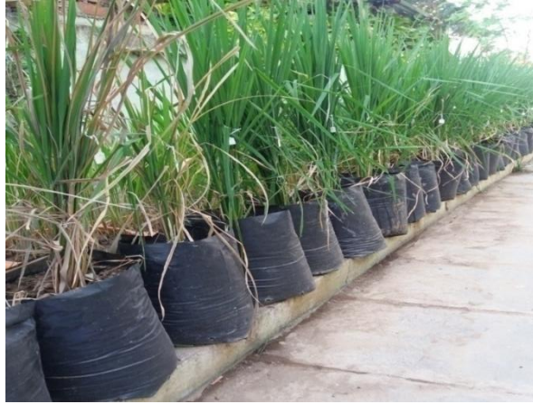
Fig.1.1: Comparative efficacy of Trichoderma isolates with reduced disease severity of sheath blight and increased yield of paddy

*Data in parenthesis shows Arcsine transformation