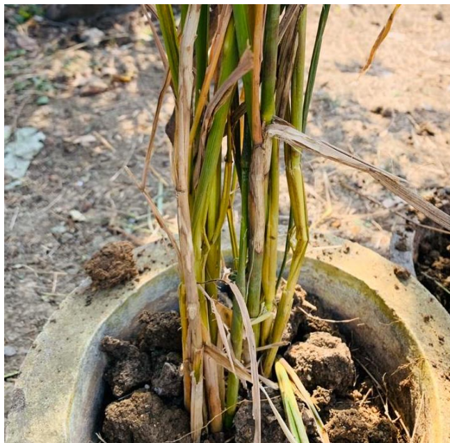
Fig.1.4: Symptoms developed on plants at 10 days after second inoculation