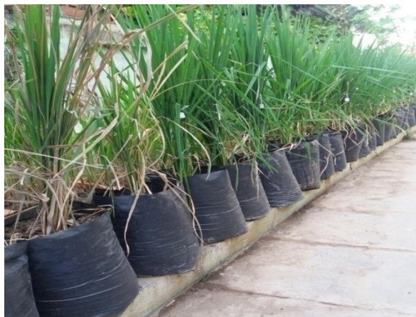
Fig.1: Comparative efficacy of Trichoderma isolates with reduced disease severity of sheath blight and increased yield of paddy