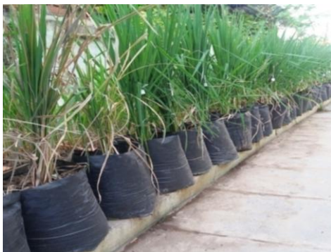
Fig.1.1: Comparative efficacy of Trichoderma isolates with reduced disease severity of sheath blight and increased yield of paddy

*Data in parenthesis shows Arcsine transformation