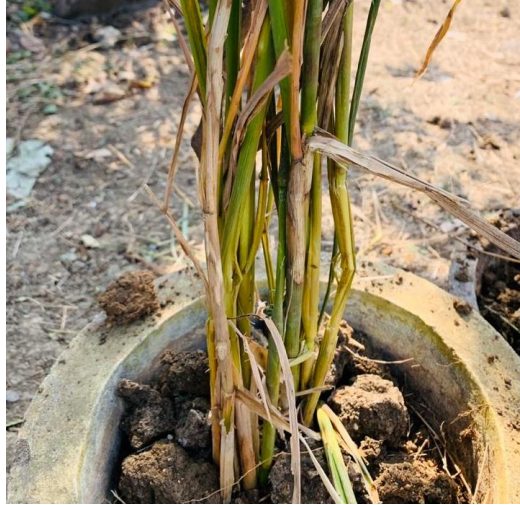
Fig.1.4: Symptoms developed on plants at 10 days after second inoculation