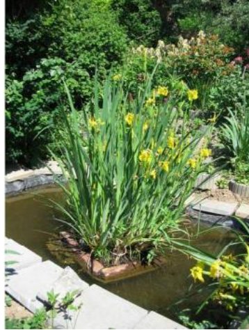
Figure 3: Small Natural Wastewater Treatment Plant without Outflow (Final Treating Tank with Floating Islands with Yellow Hyacinth) Forms an Aesthetic Element in the Garden [Anonymous (N.T. W.T. Report), 2014]