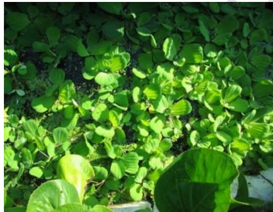
Figure 4: Fast-growing floating aquatic plant Pistia stratiotes in the final treating tank Iris and Water (Bodík I. et al. , 2012)