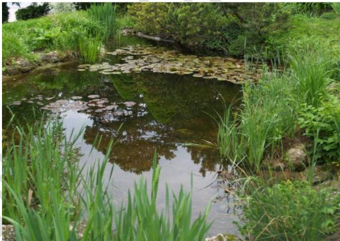
Figure 2: Arrangement of Small Treatment Pond with Water and Wetland Vegetation

The technique incorporates additional barrier components from roots of mangrove plants to reinforce the membrane, making it even more strong and resilient. To extend the membrane's lifespan even further, the team embeds the aquaporin proteins in vesicles structuring like a cell, which protect the proteins from deterioration. The given figures 2, 3, and 4 show waste water treatment methods that employ various aquatic plants.