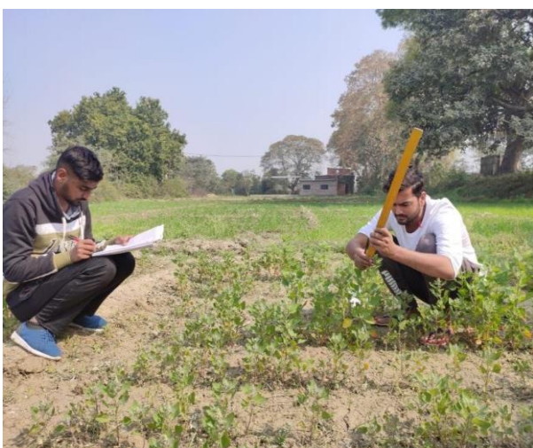
Image 1 Data Collection

At 40, 60, and 120 days following seeding, the total leaves of the three tagged plants were counted, and the average number of leaves was computed.