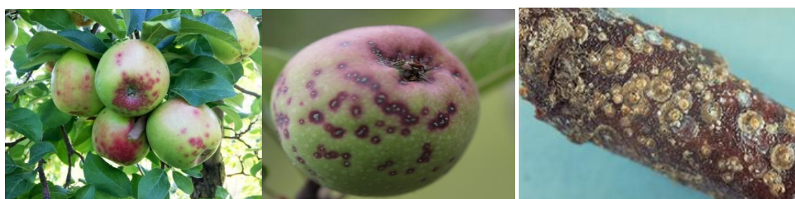
Fig. 2 : Some photographs from control plants of apples infested heavily with San Jose Scale ( Quadraspidiotus perniciosus ).