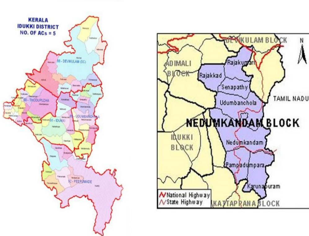
Fig. 1. Map of the study area.