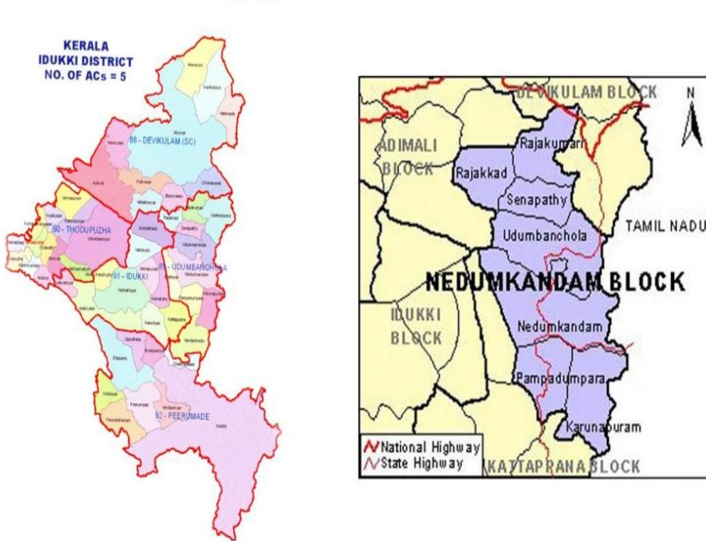
Fig. 1. Map of the study area.