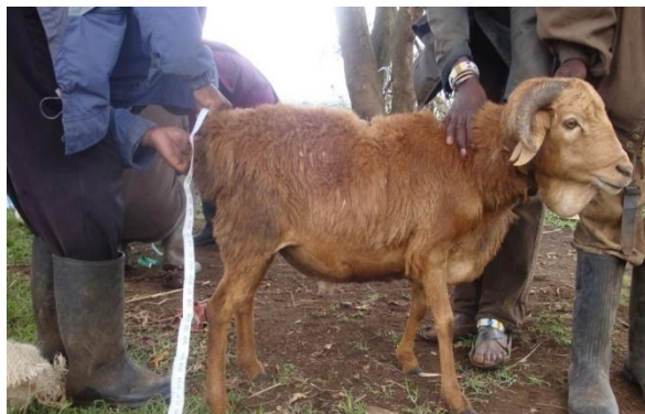
Figure 3: A red Maasai sheep with horns curved backward in Arumeru

Chi-square calculated at 5%, NS= not significant, * P < 0.05 , ** P < 0.01 , *** P < 0.001