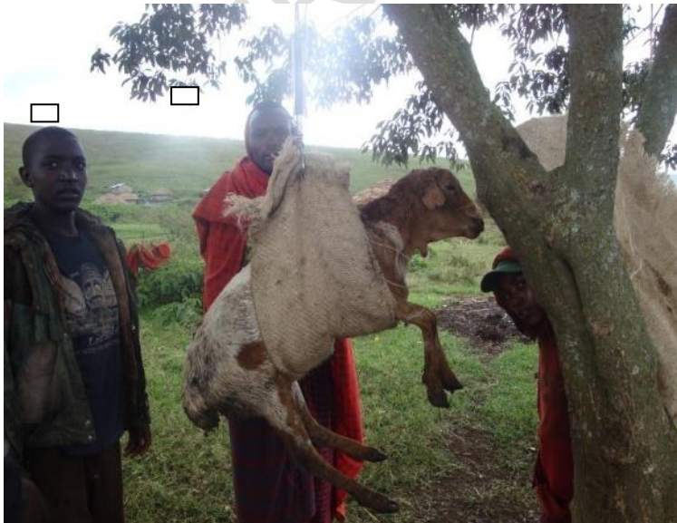
Figure 2: Body weight measurement by spring balance at Mondulijuu village