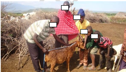
Figure 3: Body length measurement using tailor's tape at Ngabobo village