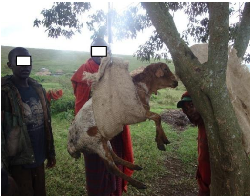
Figure 2: Body weight measurement by spring balance at Mondulijuu village