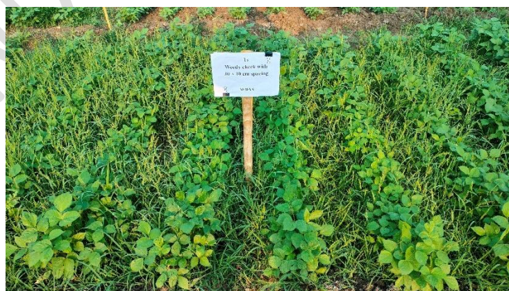
Figure 8. Weedy Check plot