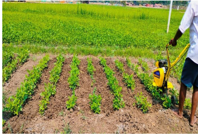
Figure 4. Power operated weeding