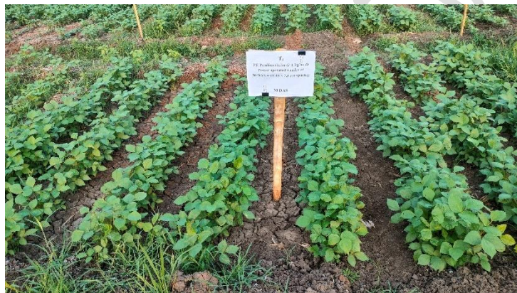
Figure 7. PE Pendimethalin 30% EC @ 1 kg ha -1 fb Power operated weeder at 20 DAS with 45 × 7.5 cm plant spacing (T 4 )