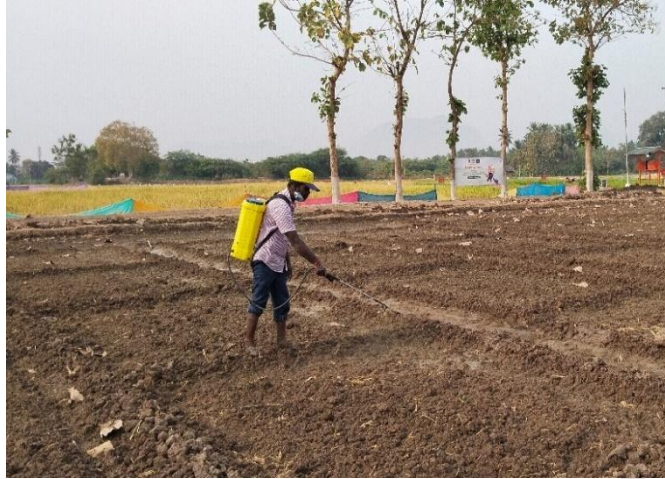
Figure 2. PE application of Pendimethalin 30% EC @ 1 kg ha -1