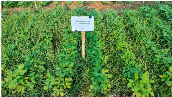
Fig 7. Weedy Check plot