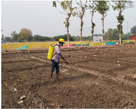
Fig1. PE application of Pendimethalin 30% EC @ 1 kg ha -1