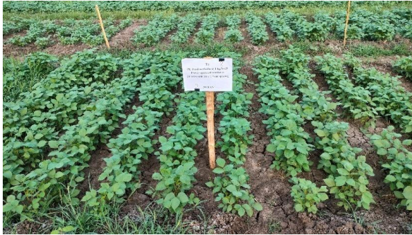
Fig 5. PE Pendimethalin 30% EC @ 1 kg ha -1 fb Power operated weeder at 20 DAS with 40 x 7.5 cm plant spacing (T 3 )